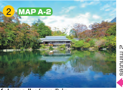
Kohama-Ike(pond) in 10 minutes Rakujuen (park)

A 5 km walk takes about 2 hours. No. = Explanations are on the back of the map.