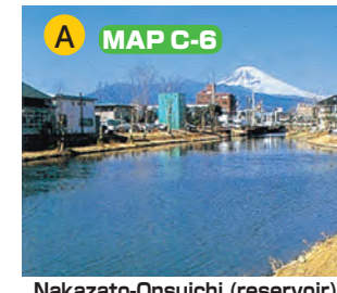
Nakazato-Onsuichi (reservoir) You can get a nice view of Mt. Fuji here.