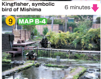
Mishima-Baikamo-no-Sato (the pond where Mishima Baikamo grows)