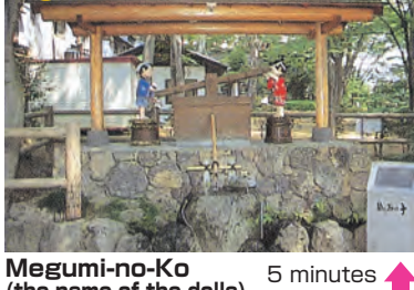
(the name of the dolls)